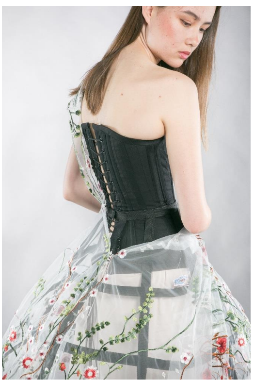
Page 3 of 3