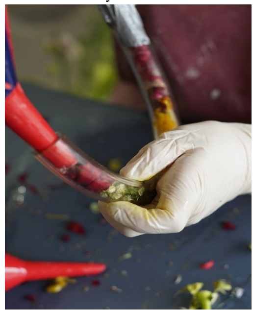
Figure 3. Pouring resin into PVC tubing

Fight or Flight is a visually impactful, unique, and sentimental handbag accessory that is meant to evoke an emotional conversation in regard to mental health. The combination of aesthetic and visual elements make for an interesting and complimentary piece that can elevate and add meaning to any wardrobe.