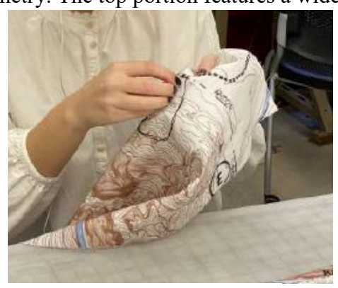
Figure 3. Hand embroidery.

print that covers the sleeves, while the second print used appears on the right side of the pants and elongates the leg. The top includes a built-in kimono sleeve and a wideset collar. The pleated right sleeve cuff was patterned separately and was simply a large rectangle. The wearer's left pleated pant demonstrated an extremely large pattern to allow for all the pleats to sit perfectly on the left side of the pant leg. In order to hold the pleats but still flow, plain cotton twill fabric was chosen to create the pleats panel. All of the pleats were stitch down at one inch from the stitch line to add another small but important detail to the design. The pleated details on opposite sides of the design contrasted each other and pushed the design across the body.