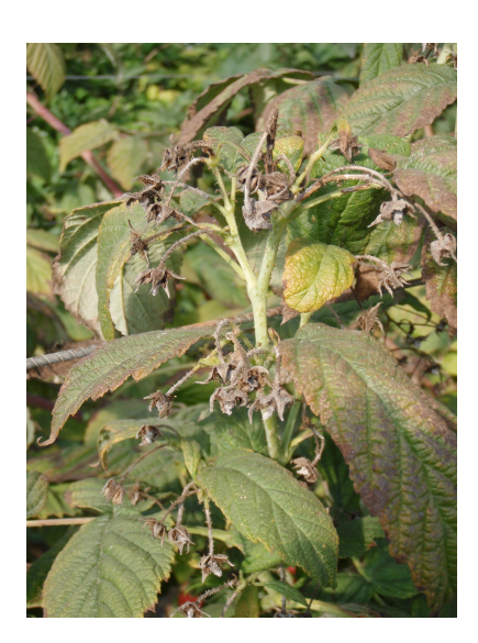
Figure 4. Botrytis fruit rot on Autumn Bliss raspberry blossoms and developing fruit.