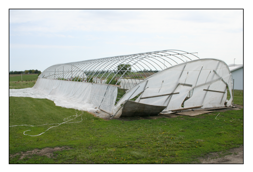
Figure 3. Wind damage to the high tunnel at the Armstrong Research Farm on May 25, 2008.