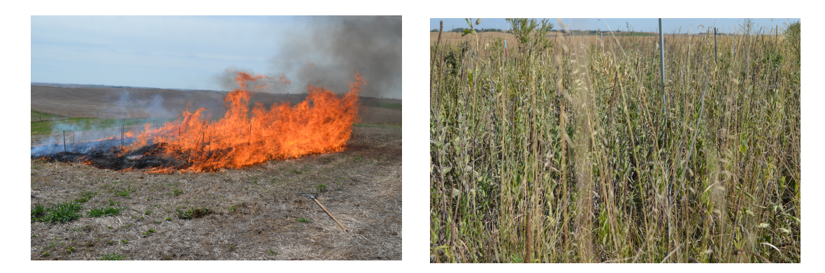
Figure 1. Experimental biochar plots, after prescribed burn March 28 (a) and prairie vegetation in September (b) 2012, at the ISU Western Research Farm.