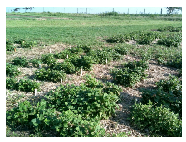
Figure 2. Unique genetic lines of common beans varying in capacity for nitrogen fixation.