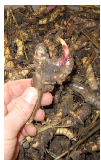
Figure 2. Field dug rhizomes of M. x giganteus.