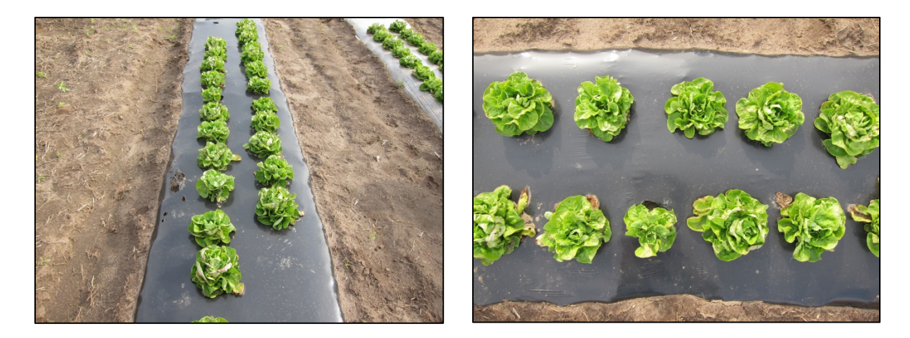
Figure 6. Lettuce in black plastic treatment at the time of harvest.