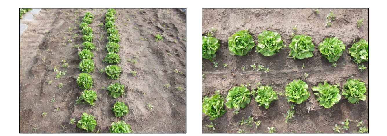
Figure 5. Lettuce in bare ground treatment at the time of harvest.