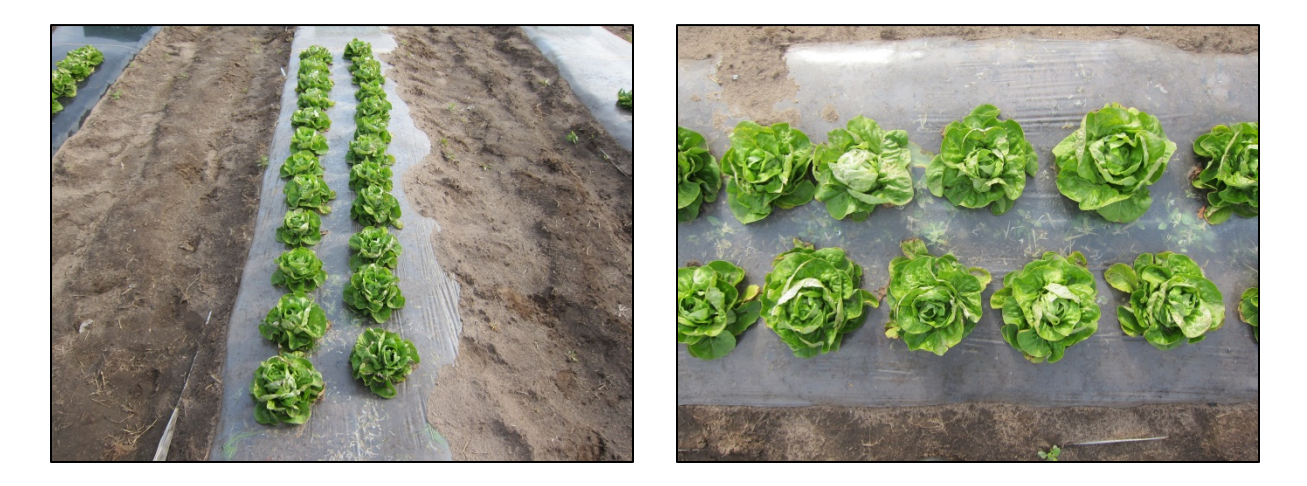
Figure 7. Lettuce in Greenshift plastic mulch treatment at the time of harvest.