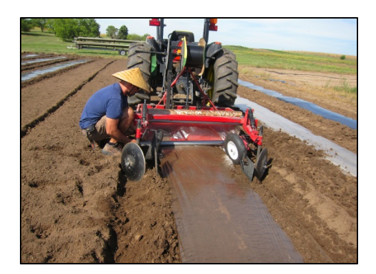
Figure 3. Laying of Greenshift plastic mulch using plastic mulch layer.