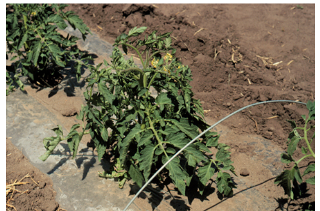
Removal of row cover about the first of June in central Iowa.