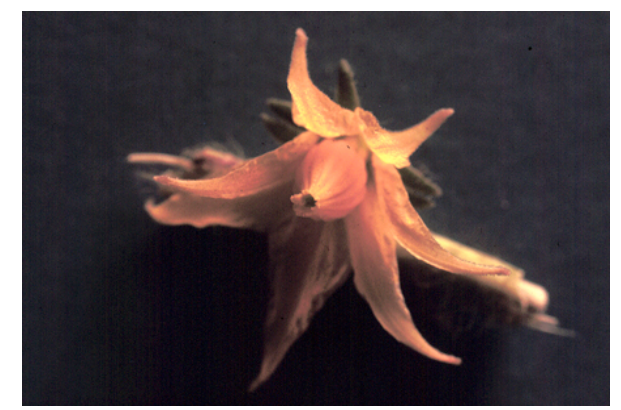
Tomato flower at anthesis – subject to high temperature flower abortion.