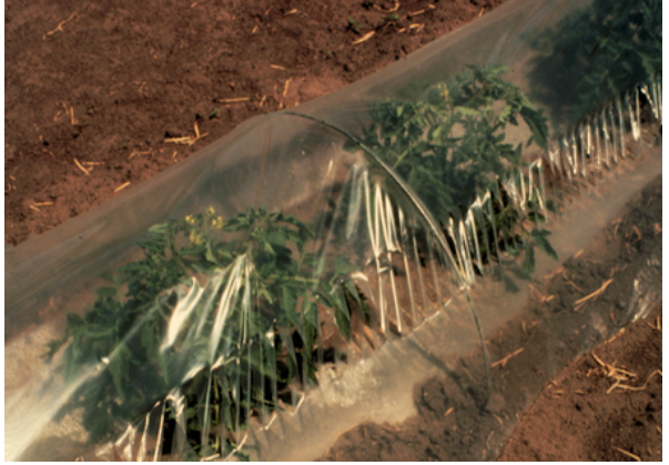
Remove or open row cover to avoid high air temperatures when first flower clusters are open.