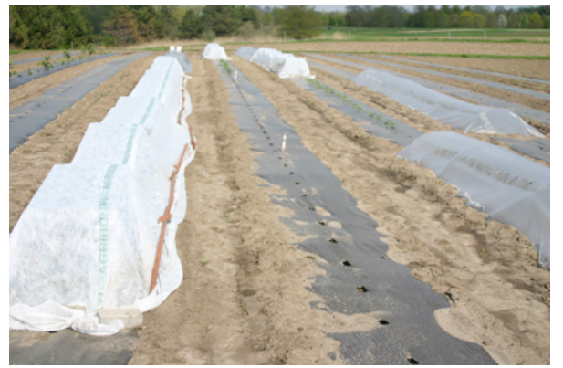
Agribon and slitted, clear-hooped row covers.