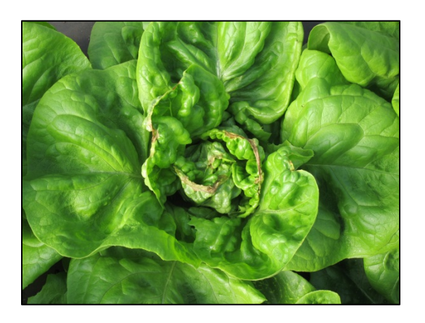
Figure 3. Typical symptom of lettuce tipburn.