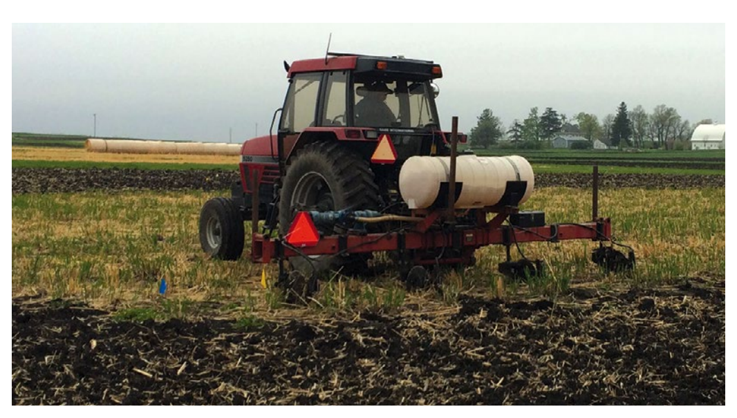
Figure 1. Side-dresser used for applying liquid UAN to Miscanthus plots prior to planting.