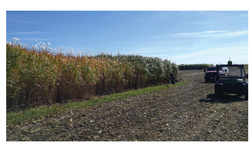
Figure 5. Miscanthus morphological response to N fertilizer at the Sorenson research farm. Nrates pictured left to right: 224, 0, 448 kg N ha-1.