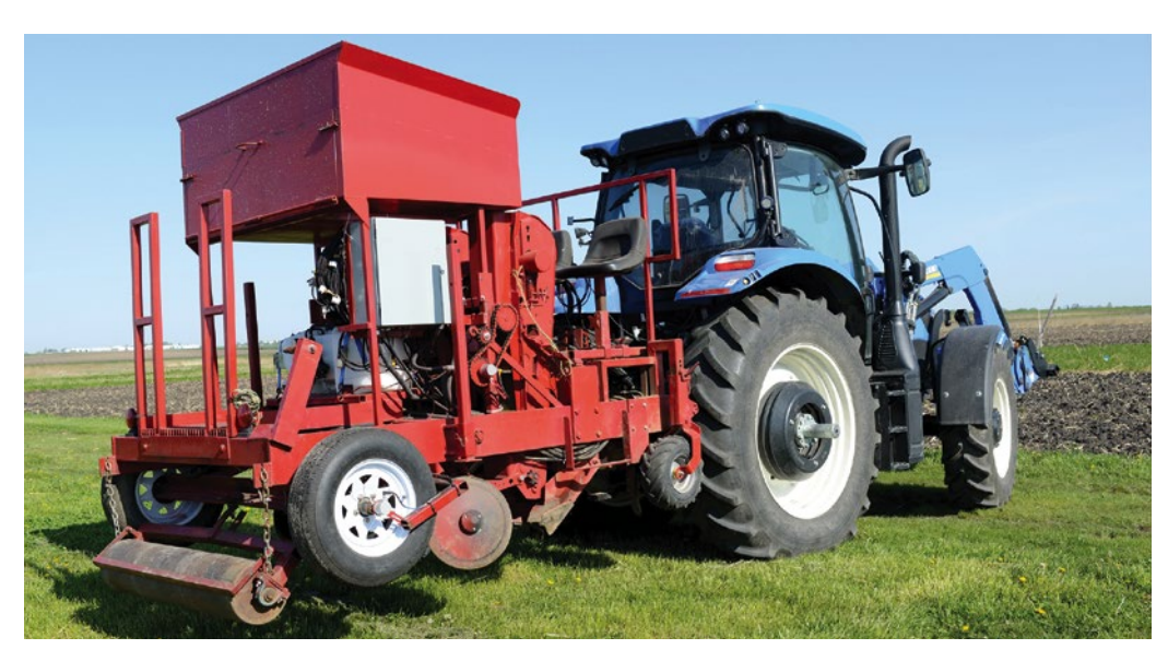
Figure 2. Proprietary Miscanthus rhizome planter.

N application. A liquid solution of urea ammonium nitrate (UAN-28% or 32% depending on the farm) was applied prior to planting using a sidedressing applicator (Figure 1) or was applied over the top using spray equipment. Nitrogen was applied at the appropriate rate each spring prior to, or as close to emergence as possible.