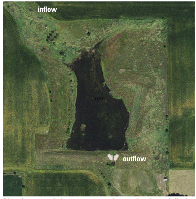
Plot of measured nitrate concentrations and estimated discharge. Aerial photo of the Wilkin wetland.

The estimated nitrate removal efficiency having nitrate concentration measurements is 43%. Because this wetland is not instrumented for flow measurement, flow was estimated from the wetland watershed area and measured flow at a nearby location. On the basis of the wetland to watershed area ratio and typical water yields for Floyd County, we estimate that this wetland would have an average nitrate removal efficiency of about 35 to 40%.