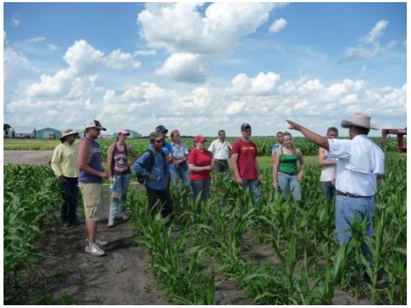
Figure 3. A graduate student leads a group of students through the haploid nursery.