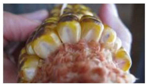
Figure 2. Haploid selection based on a seed color marker. Induced seed have a colored crown, diploid hybrid seed has a dark embryo, and haploid seed has a clear embryo (fourth from the left).