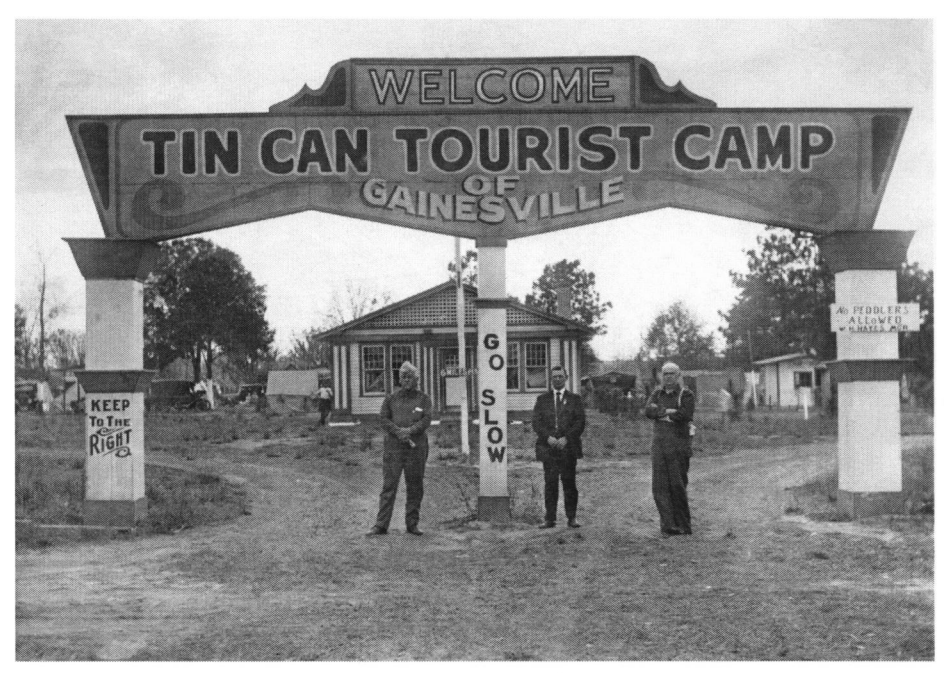
Tin can tourist camp, Gainesville, Florida, c. 1920s.

The brief history of the organization in the text of the exhibit goes on to say that TCT usually held a summer meeting in Michigan each year, while a winter meeting was held at a campground in Florida "in various places, including Tampa, Sarasota, Ocala, and Eustis." The meetings provided social opportunities, a venue for formal club business, and exhibits by "manufacturers of trailers, mobile homes, and camping gear." Vendor exhibiting continued when meetings resumed after a brief hiatus during World War II.