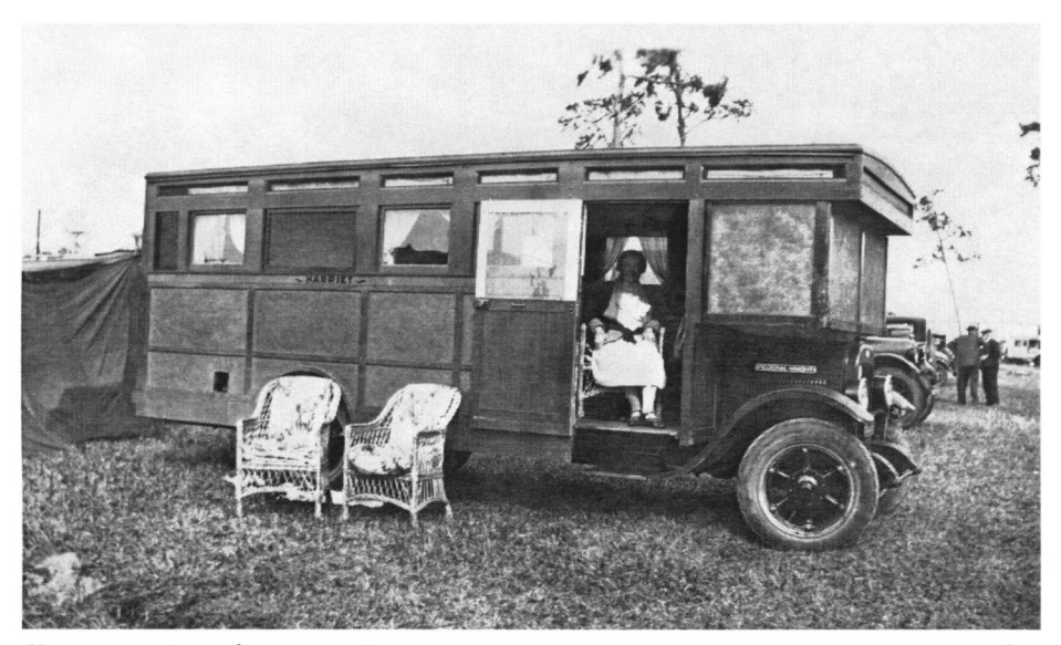
House car named "Harriet" at Tin Can Tourists Association Convention, Arcadia, Florida, January 10, 1929. Image N028617, General Collection, State Archives of Florida.

Conway and Puzalan's study looked at high-level users of digital photograph collections, focusing on the types of products they produced, the rigor of their research methods, and their affiliations. In earlier studies, Conway looked at different levels of users. The literature examining the relationships among online exhibiting, patron use and archival practice, and public history and physical exhibiting is relatively recent and scattered. Arjun Sabharwal, in "Digital Representation of Disability History,"