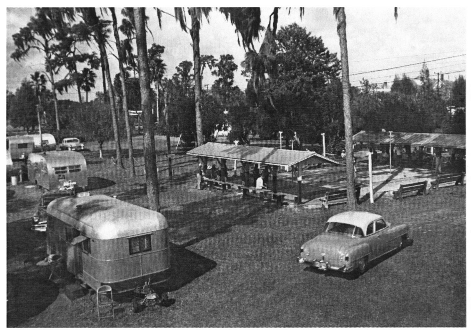
Tin Can Tourists Association Convention, Arcadia, Florida, 1953.