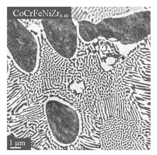
Figure 1. SEM BSE image of the CoCrFeNiZr<sub>0.40</sub> sample. The darker blobs are small parts of the bulky dendrites. Note that there are only two phases in the image, the darker fcc solution (dendrites, dark eutectic lamellas) and the lighter C15 Laves (light eutectic lamellas only).

To sum up, the magnetism of CoCrFeNiZr_x eutectic HEAs is a problem of a multiphase "real" HEA, where simple compositional averages are not sufficient and the situation is severely complicated by the microstructure. The take-away message is that one might need to be careful to include or at least consider the microstructure in interpretations of physical properties of multiphase "real" HEAs.