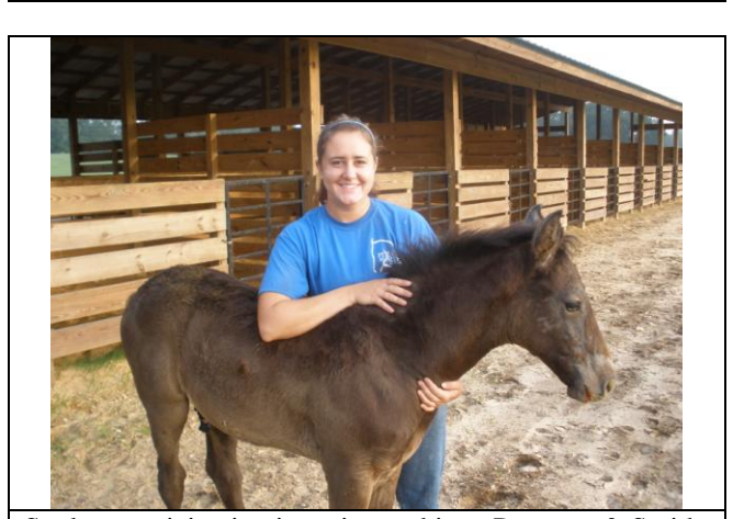
Student participating in an internship at Peterson & Smith Equine Hospital in Florida