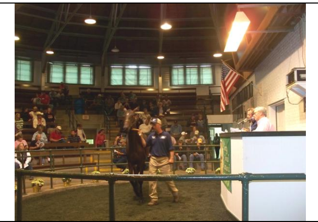
High Selling ISU Thoroughbred at the Iowa Thoroughbred and Breeders Association Sale.