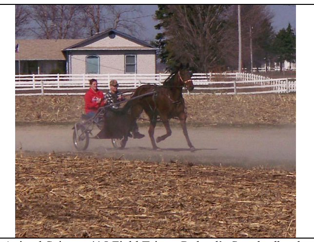
Animal Science 415 Field Trip to Roland's Standardbred Farm in Grinnell. Students were allowed to drive the race horse.

Seven University bred race horses were very successful at Prairie Meadow this past season, with others coming in on the money at other tracks around the nation.