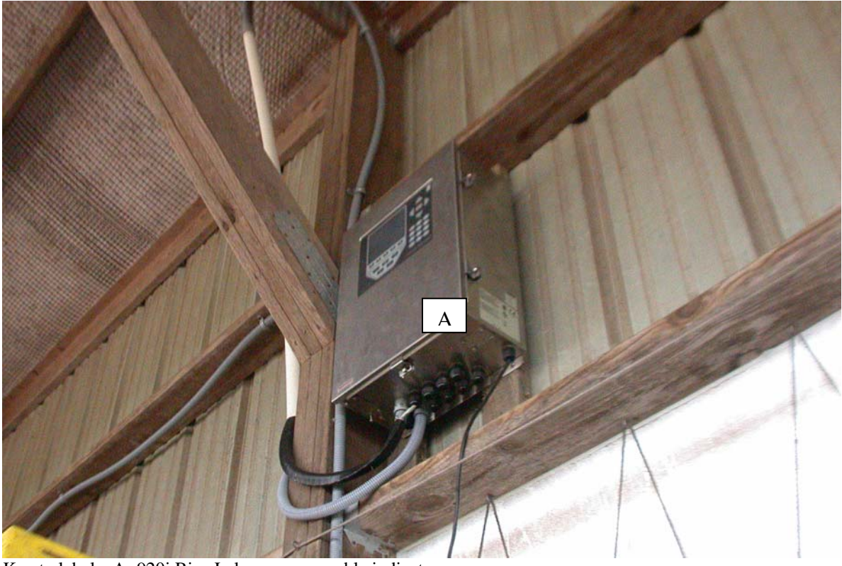
Key to labels: A=920i Rice Lake programmable indicator