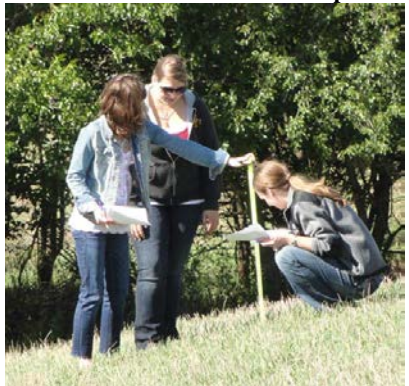
Figure 2. Students in ANS 415 conducting a pasture walk.