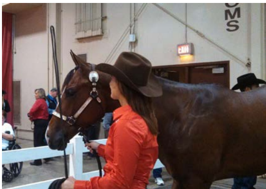
Figure 4. Students are able to show off their hard work and experience a larger portion of the industry when they travel to the large sale venues where the ISU horses are marketed. For many students, it is their first up close look at the horse industry from a production and marketing perspective. Students enjoy not only training and fitting the young horses but also getting to interact with the sales personnel, potential buyers and all of the professionals who are also marketing or buying prospects whether it is for show, racing or recreation.