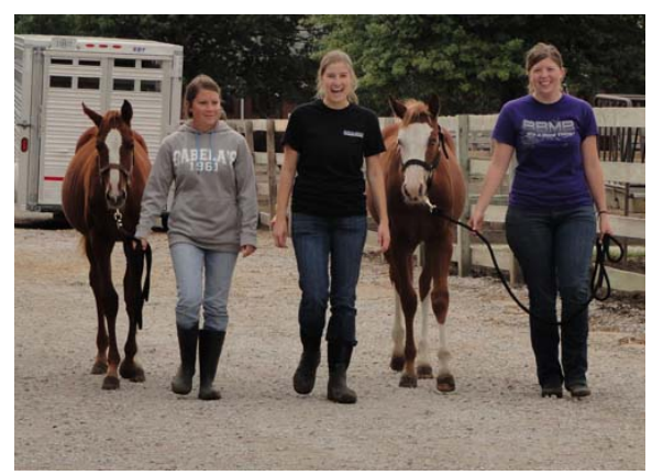
Figure 1. Students from ANS 493 Workshop in Horse Sales.