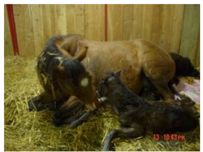
Figure 4. Hey Marthy (Thoroughbred mare) foaling on 3/14/03.

Equine Systems Management (ANS 415): The senior course teaches management techniques. Students learn computer-aided management of horse operations, business issues such as liability and insurance, nutritional management of horses including evaluation of rations, and current concepts in reproductive management of horses. On average, 35 students take the class in the spring. Examples of student activities include: Foaling Project – Students are divided into groups and assigned a mare that is due to foal. The mare is brought