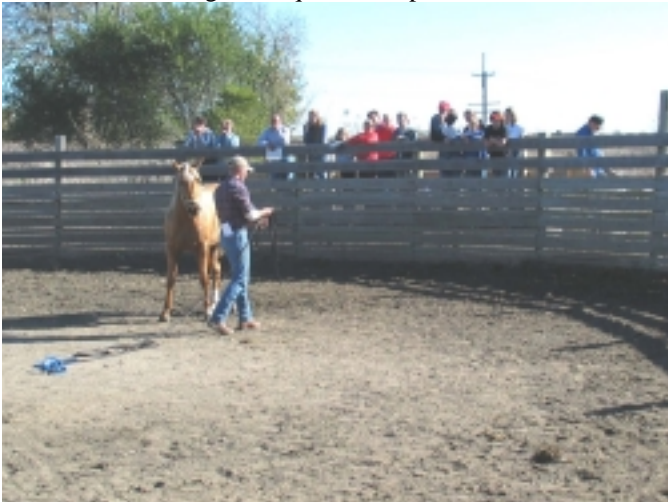
Figure 2. Mason Kolbet demonstrating round-pen training at the horse barn open house.

Training the Horse (ANS 316): The class is held in the fall semester. Class size is limited to 16 students. Students learn about modifying the behavior of the horse for performance objectives through bitting, longeing, saddling and riding. Each student is assigned a horse to train for the semester. The student needs to problem solve the horse's behavior to train the horse so that it can be ridden by the end of the term. Prior to 2002, most of the horses used in the class were University owned horses. In 2002, client owned horses were recruited for the class. Each client pays a fee to the barn to have students train the horse. Students are required to write professional letters to the owners and keep them updated on the horse's progress. Students also meet with the owners at the end of the class and demonstrate to the owner the progress they made with the horse. The class is a great practical teaching experience for the students. In 2003, at the open house at the horse barn, students had to demonstrate training techniques to the public.