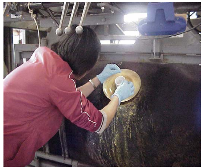
Figure 2. Photo of sampling the gas in the headspace of rumen with SPME.