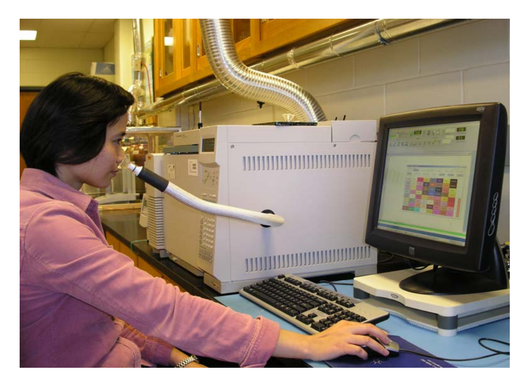
Figure 3. Panelist evaluating odor of rumen gas.