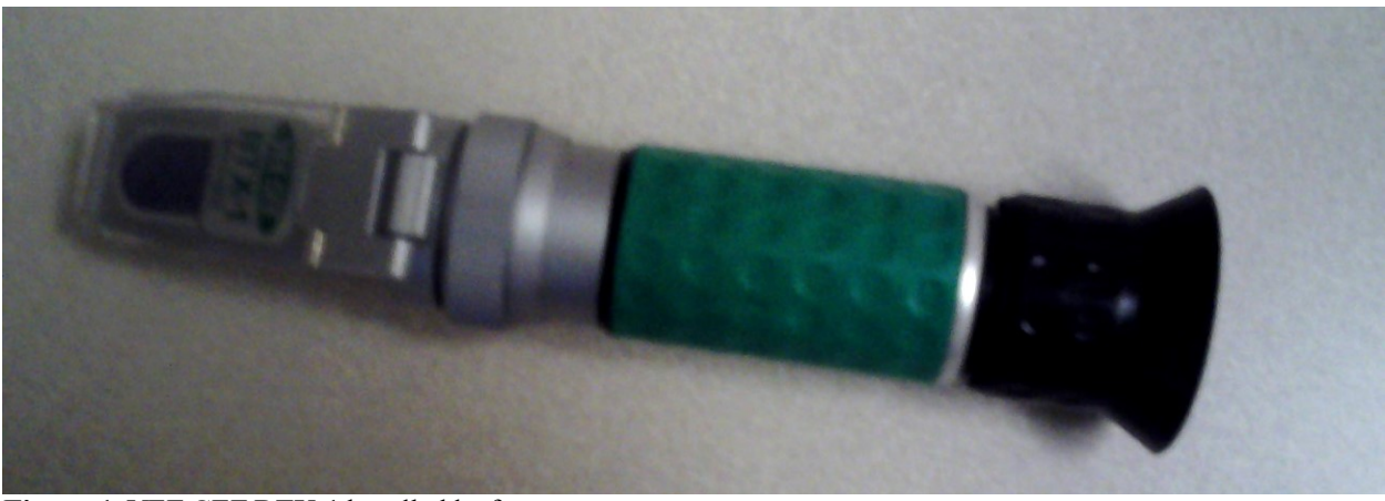
Figure 1. VEE GEE BTX-1 handheld refractometer.