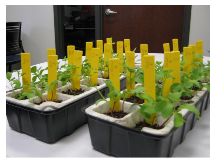
Figure 2: Radishes and Wisconsin Fast Plants® grown from seeds that were flown on the inside and outside of payload cotainers and from control seeds.

<u>Plant seeds</u>: After the flight students should plant their seeds, place them in a location with sufficient light, and regularly water them. To assess the effects of the near-space environment students can quantitatively evaluate a variety of traits related to reproductive rates and phenotypic traits, such as germination rate, plant height, weight, number of flowers and seed pods and seed pod size. In our experiments we found that the near-space environment had no effect on germination rate, i.e., near-100% germination rates for seeds flown on the inside and outside of the payload containers. We analyzed number of flowers and seed pods and length of the longest seed pod using ANOVA statistics. For all three traits the seeds flown on the outside had the lowests averages. To identify potentially interesting mutations, we computed the coefficient of variation for each trait, which is defined as the standard deviation divided by the mean. In all cases this coefficient was largest for seeds flown on the outside.