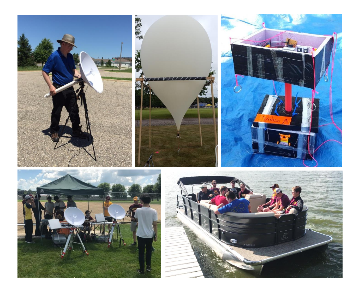
Fig. 3 Testing images (left to right then top to bottom): (a) manual pointing of a video-telemetry antenna, (b) a balloon-tether "corral", (c) a video-telemetry system attached to an active-pointing CHAD device, (d) a down-range ground station, and (e) setting out on a lake-recovery one week before the eclipse.

On eclipse day ground stations were set up (and staffed by students) at the Stuhr Museum of the Pioneer Pioneer in Grand Island and at The Leadership Center (where the team was staying) in Aurora, about 20 miles farther east. Five balloons, three with video-telemetry stacks, were inflated and launched between 90 and 60 minutes prior to totality from Kenesaw (to the southwest) so as to be visible from both Grand Island and Aurora and ascending between 60,000 and 90,000 feet when totality arrived at 1 p.m. local time (see Fig. 4). Winds were light and cloud cover was intermittent right up to totality but, in fact, all team members on the ground did ultimately get a clear view of totality, albeit from about a half-dozen locations scattered around the Grand Island/Aurora area. Kenesaw was near the edge of the path of totality, so the launch crew did not stay there once the balloons were in flight.