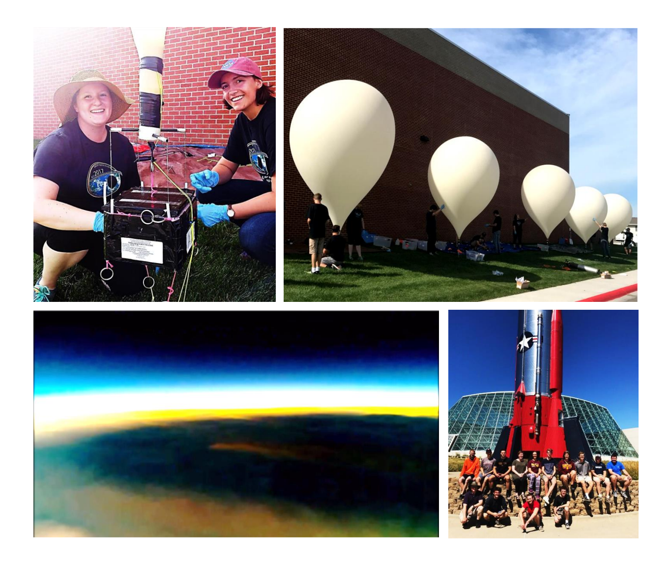
Fig. 4 Images from eclipse trip (left to right then top to bottom): (a) passive anti-rotation device, (b) line of balloons, ready to release, (c) view of receding eclipse shadow from 66,000 feet above Grand Island, Nebraska, and (d) UMTC team (most of it) at Strategic Air Command (SAC) museum on return trip to MN.

The balloon inflations, tethers, then timed launches went very smoothly, especially considering the fact that our team had never tried a five-balloon launch and about half the people at the launch site were not actually on the summer 2017 ballooning team (though most did have past experience with ballooning). One balloon – the very last one to be launched – looked distorted even during inflation and ultimately popped early at 49,000 feet, about 15 minutes before totality. Prior to burst that balloon had a good video feed to the ground station in Grand Island.