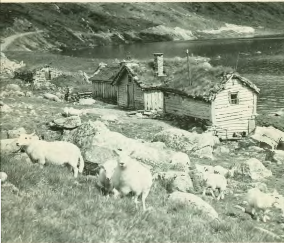
Fig. 12—Landrace sheep grazing in the mountains of Norway. A strict disease control program keeps these flocks free of many of the contagious diseases which infest American livestock (Chap. 18).