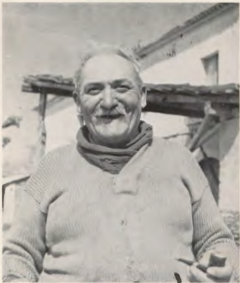
Fig. 3—This happy Italian farmer lives in southern Italy. Like others of his kind, he faces the problem of too many farmers on too few acres (Chap. 2).