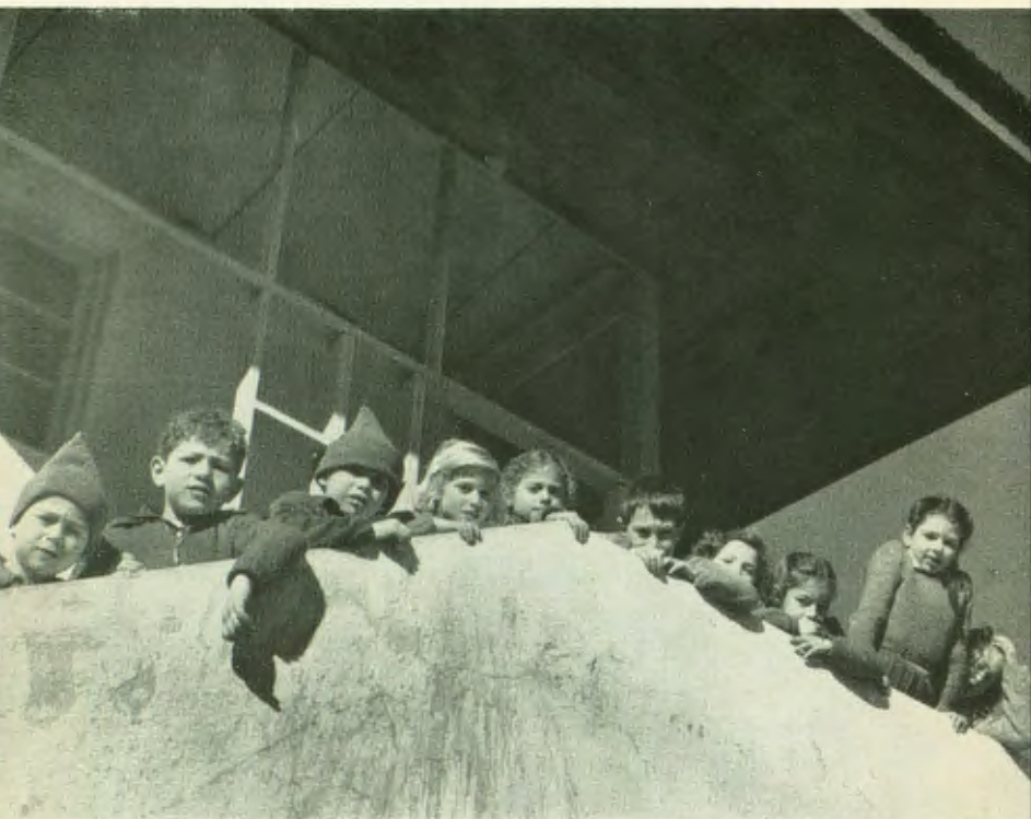
Fig. 9—These Israeli youngsters live on a kibbutz, a communal farm. Most of the communal farm land is owned by the Jewish National Agency which rents it to the farmers (Chap. 10).