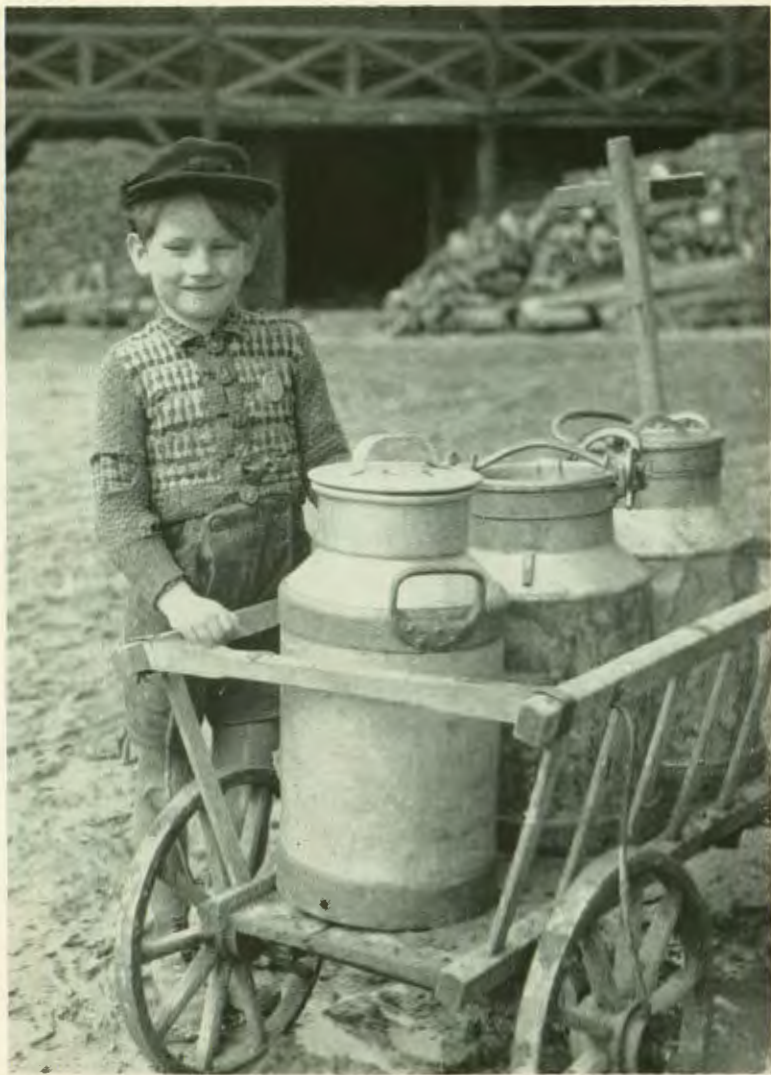
Fig. 7—The future of this German farm lad depends on how his people will move. To preserve democracy they must cast off the cloak of political neutrality (Chcp. 7).