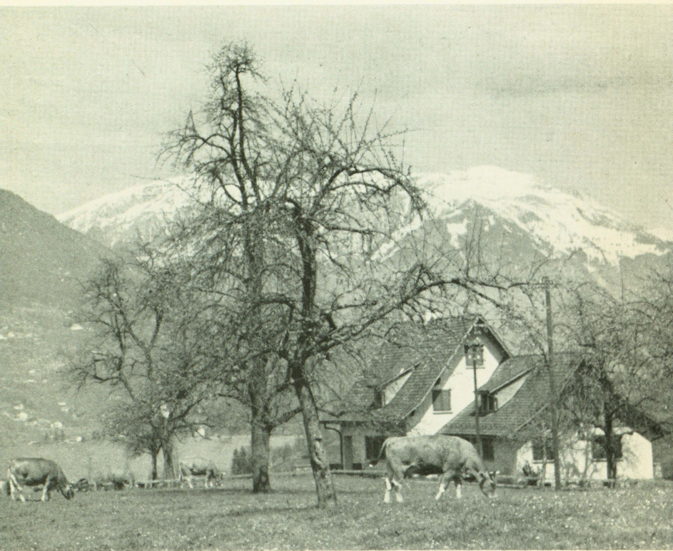
Fig. 11—Brown Swiss cattle graze alongside a lake in Switzerland. In summer they graze above the timber line. Grass, cows, and trees all make their contribution to a balanced Swiss agriculture (Chap. 14).