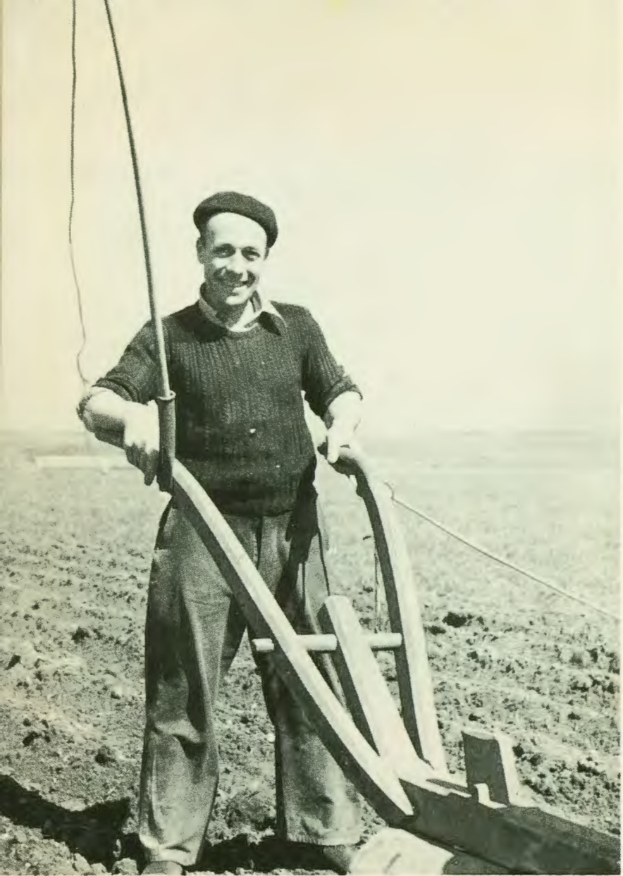
Fig. 10—This French farmer spends much of his time going from one small plot of land to another since his farm consists of many small patches scattered over a wide area. This problem, caused by land inheritance laws, plagues much of central Europe (Chap. 11).