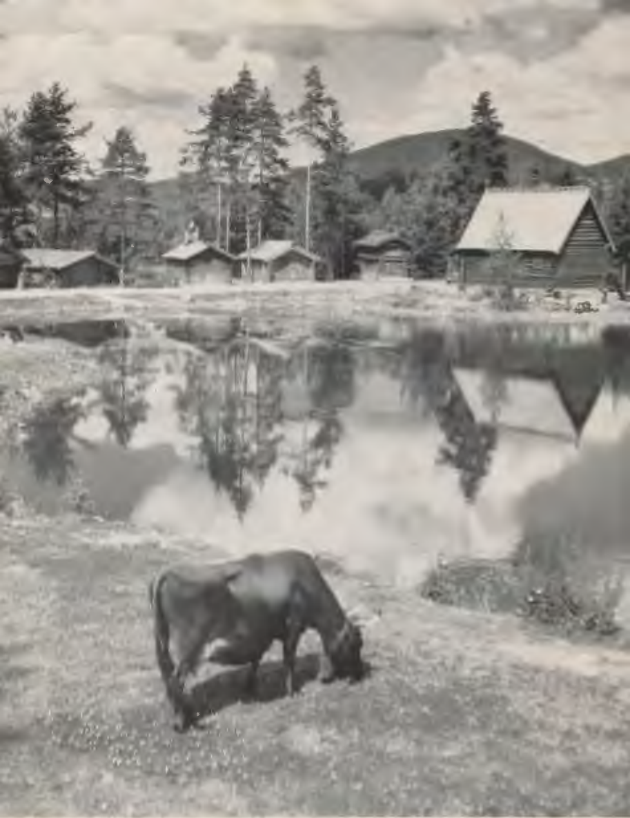
Fig. 1—Dairying is important to the Norwegian farmer. To protect the price, milk is sold under a public utility monopoly (Chap. 5).